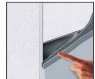
Thermal & acoustic insulation