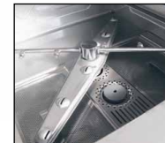
Integral tank filters